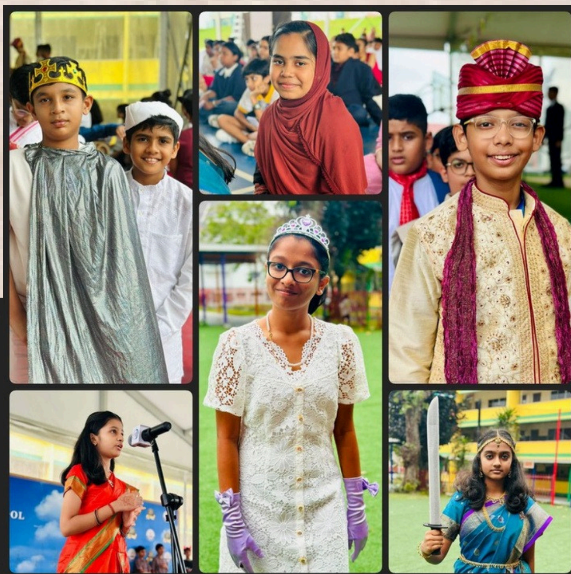
HISTORICAL FANCY DRESS